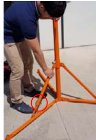
Place legs onto a flat surface and align adjustable locking column with pin holes to for uneven surface. (red circle)