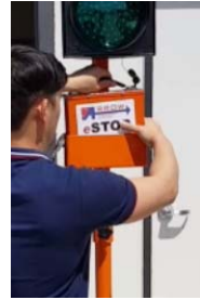
Insert battery pack into battery holder