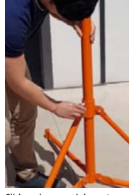
Slide pole up and down to adjust height then release pin to lock in place