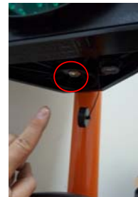
Switch on lantern