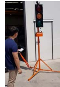
Unit is ready to operate with Hand Remote Control

IMPORTANT: ensure eSTOP™ is stable and is weighted down with sandbags prior to operation. One sand bag per tripod leg is required.